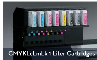
CMYKcLmLk 1-Liter Cartridges