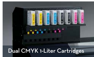
Dual CMYK 1-Liter Cartridges

The EJ runs optimally with Roland DG EJ inks in 4-color or 7-colors and high-capacity 1-liter cartridges. The result? High-volume printing and bold, exciting colors at costs up to 35% lower than the competition.